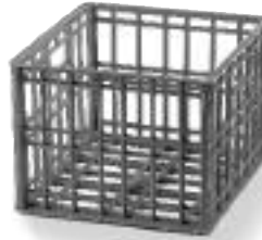
For 13" x 13" (33 x33 cm) Milk Crates (Not available by Cambro)