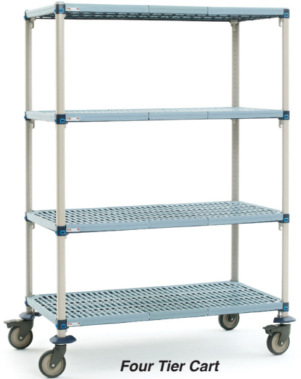
Four Tier Cart