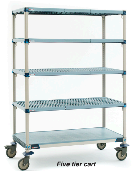
Five tier cart

Quick-to-adjust, corrosion resistant mobile shelving offers a sturdy, long lasting movable storage solution or transport cart. Rigid one-piece shelf frame with wraparound corners provides complete 360° capture of the wedge and post to ensure stability, and overall strength. Shelves have polymer shelf mats that are impact resistant for long life and quick-to-remove for easy routine cleaning. The shelf frames have a durable epoxy coating over an electroplated substrate. Shelves offer a 20 year warranty against corrosion. Rust proof polymer posts offer a lifetime warranty against corrosion. Shelf mats and posts have built-in Microban® antimicrobial product protection. Proprietary quick-release corner release enables fast, no-tool shelf adjustment. Each cart can safely store or transport 900lbs. (408kg). Units assemble easily — Shelves mount on four one-piece wedges along grooved, numbered posts. Shelves adjust on 1" (25mm) increments.