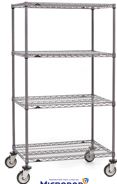
Super Erecta with Metroseal