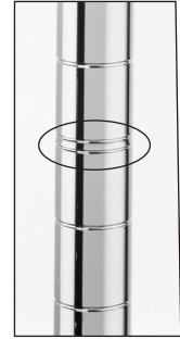
SiteSelect Posts feature double grooves every 8" (203mm) to aid assembly.