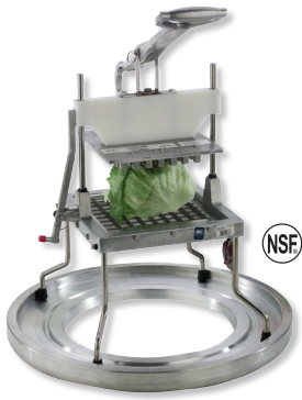
Lettuce King™ IV shown with optional drum ring

The Redco® Lettuce King™ saves prep time and streamlines handling for high-volume slicing and dicing of many vegetables. When using the Lincoln Redco® Lettuce King™ I, you'll achieve great results with bell peppers, onions, cucumbers, cabbage, lettuce and more. Vegetables can be sliced or diced consistently for salads, sandwiches, pizzas, stir-fry and all types of dishes. The Lettuce King™ IV will chop an entire head of lettuce into 1" x 1" squares for perfect salads with one stroke.