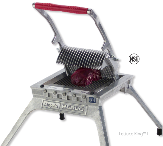
Lettuce King™ I