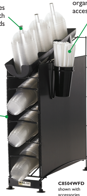
C8504WFD shown with accessories

Optional straw organizer for easy access to straws