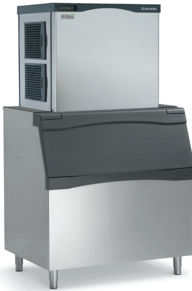
Shown on B948S bin with optional KLPSS legs.