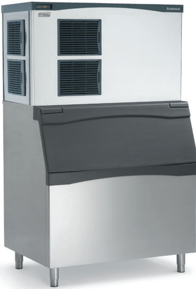
Shown on B48S bin with optional KLP8S legs.