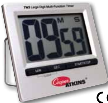
TW3 Large Digit Multi-Function Timer