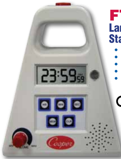
FT24 Large Single Station Timer