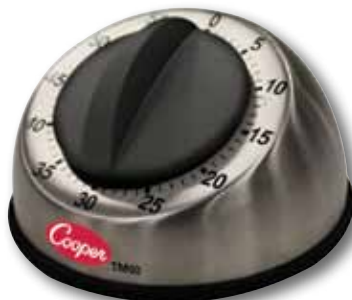
TM60 Long-Ring Mechanical Timer