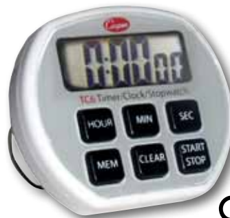
TC6 6 Button Digital Timer / Clock / Stopwatch