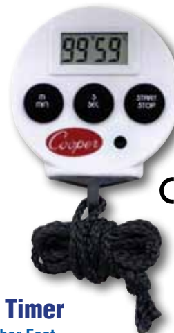
TS100 Digital Timer / Stopwatch