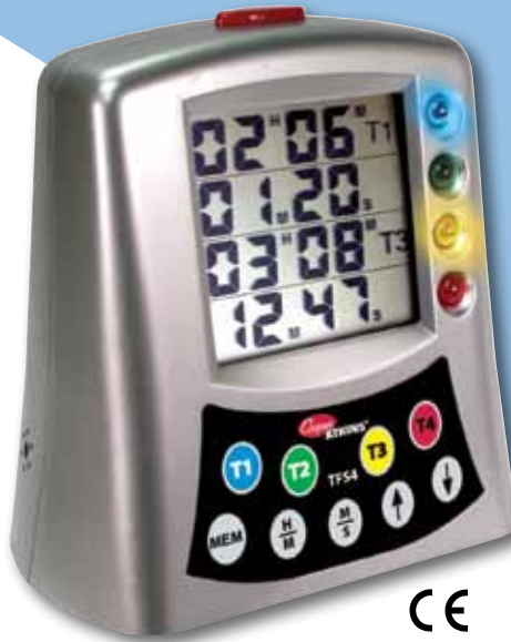
TFS4 Large Multi-Station Timer

Temperature and time are the two most important components in a food safety system. Cooper-Atkins kitchen timers are high-performing and easy to operate. Designed to be durable and water resistant for all kitchen environments.