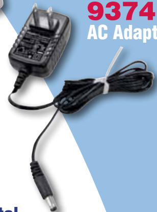
9374 AC Adaptor