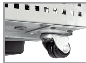
1 1/2" diameter dual swivel castors for "LP" models.