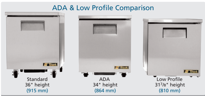
Standard 36" height (915 mm)