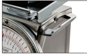
Optional carrying handle